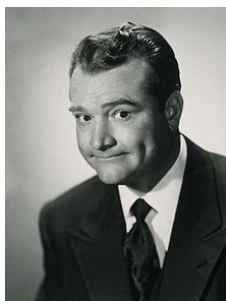
Skelton in 1960

On June 23 1970 , the last "Red Skelton Show" aired on CBS-TV Richard Bernard "Red" Skelton (July 18, 1913 – September 17, 1997) was best known for his national radio and television shows and especially as host of the television program The Red Skelton Show . The sketches were usually built around one of Red's many characters, including "Deadeye", an incredibly inept sheriff, "San Fernando Red", a shady real estate agent, "Cauliflower McPugg", a punchdrunk boxer, "George Appleby", a hen-pecked husband, "Junior", the Mean Widdle Kid", "Clem Kadiddlehopper", a hick, and "Freddie the Freeloader", a bum with a heart of gold.